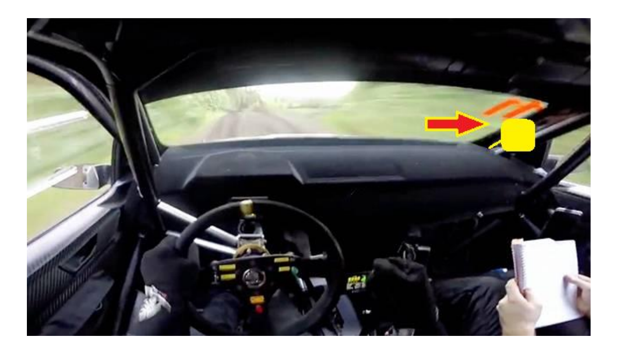
The GPS should be placed on the right pillar of the front part of the safety cage. GPS dimensions are: 150mmX90mmX45mm. The GPS has holes to be retained with tire ups.

During installation, the harness should be routed away from the engine compartment and the ignition or generator wiring of the car and ensure that it is protected from edges, etc.